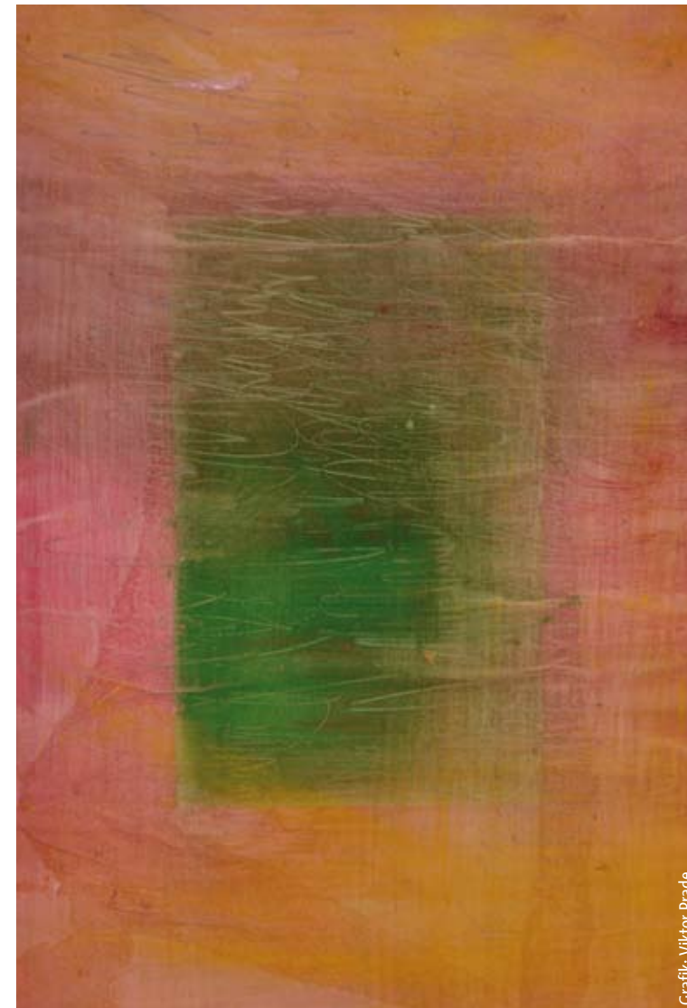
Grafik: Viktor Prade

International Chamber Choir Competition Internationaler Kammerchor-Wettbewerb Arnauer Str. 14 D-87616 Marktoberdorf Germany